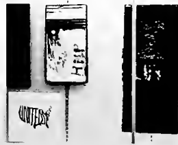
Pieces of art work on display on the second floor.

***** SELL, ADVERTISING FOR THE IU-FU COMMUNICATOR IN YOUR SPARE TIME, RECEIVE 10% OF WHAT YOU SELL! *****